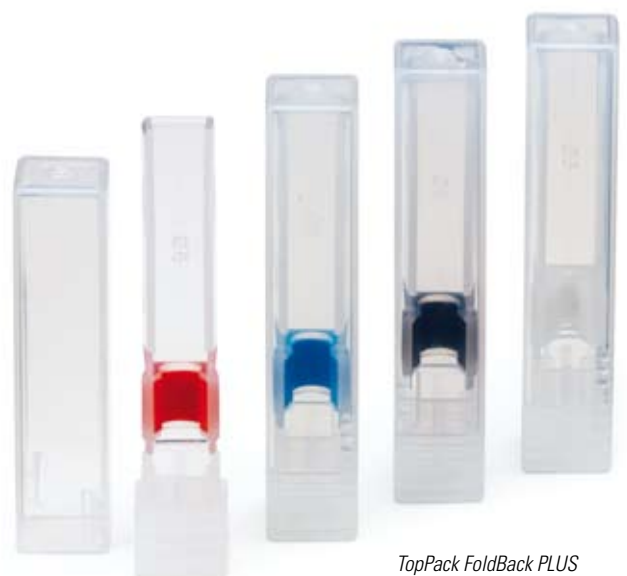
TopPack FoldBack PLUS